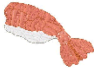
Amaebi (Raw Shrimp) 1.79" x 1.24", 4,850 stitches 3.04" X 2.12", 10,348 stitches 3.88" X 2.70", 15,013 stitches