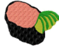
Ikura (Fish Roe) 1.58" x 1.27", 3,359 stitches 2.75" x 2.20", 7,460 stitches 3.57" x 2.86", 11,584 stitches