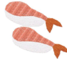
Ebi (Cooked Shrimp) 1.39" x 1.26", 2,951 stitches 2.68" x 2.24", 8,918 stitches 3.91" x 3.55", 17,262 stitches