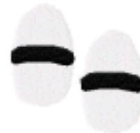
Ika (Squid) 1.27" x 1.25", 2,240 stitches 2.43" x 2.39", 6,192 stitches 3.92" x 3.85", 14,419 stitches