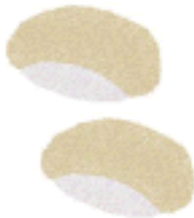
Hamachi (Yellowfin Tuna) 1.46" x 1.25", 4,150 stitches 2.76" x 2.37", 13,121 stitches 3.91" x 3.37", 25,392 stitches