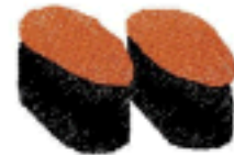
Ikura (Fish Roe) 1.82" x 1.25", 5,768 stitches 2.54" x 1.74, 8,259 stitches 3.92" x 2.68", 23,895 stitches