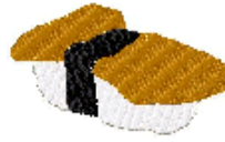
Anago (Eel) 2.08" x 1.23", 3,764 stitches 2.98"x .77", 6,580 stitches 3.90" x 2.32", 10,413 stitches